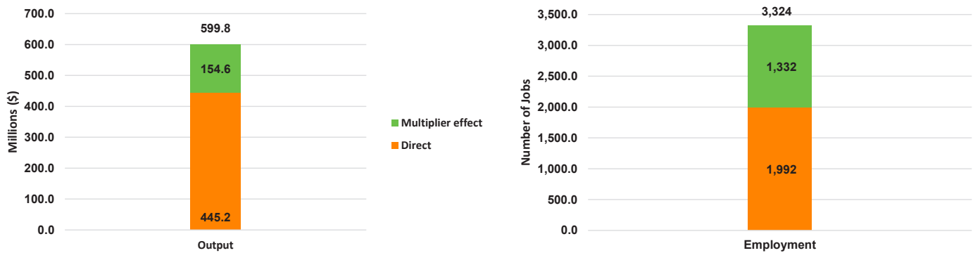
Figure 1. Agriculture’s impact on Gibson County output and employment, 2015.

The output multiplier is $1.35. A dollar of output in agriculture leads to $1.35 in county-level output (i.e., the dollar plus the $0.35 multiplier effect). The employment multiplier is 1.67. A job in agriculture leads to 1.67 in county-level jobs (i.e., the job plus the 0.67 multiplier).