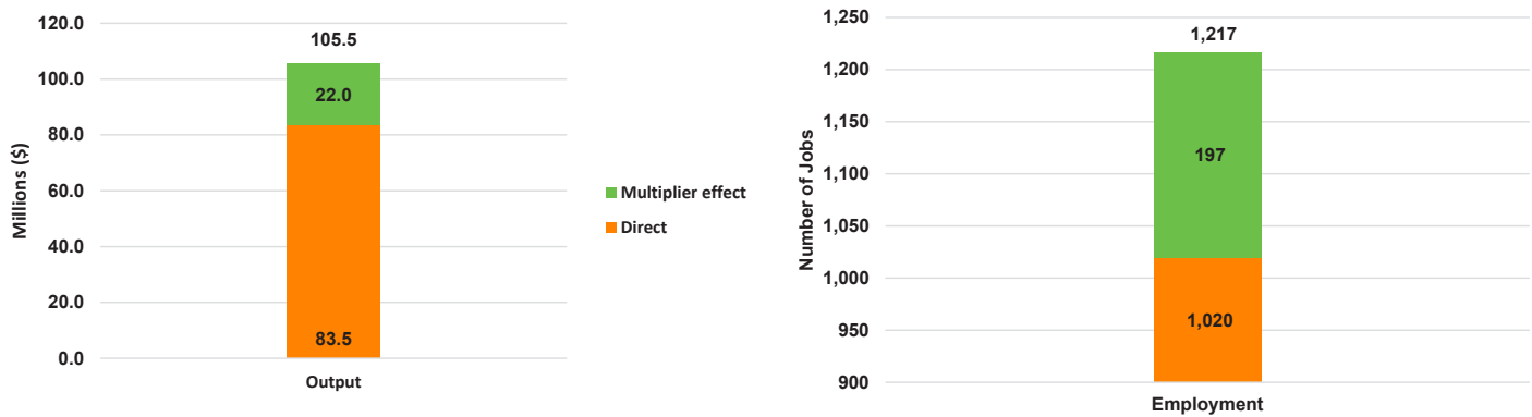
Figure 1. Agriculture’s impact on Carroll County output and employment, 2015.

The output multiplier is $1.26. A dollar of output in agriculture leads to $1.26 in county-level output (i.e., the dollar plus the $0.26 multiplier effect). The employment multiplier is 1.19. A job in agriculture leads to 1.19 in county-level jobs (i.e., the job plus the 0.19 multiplier).