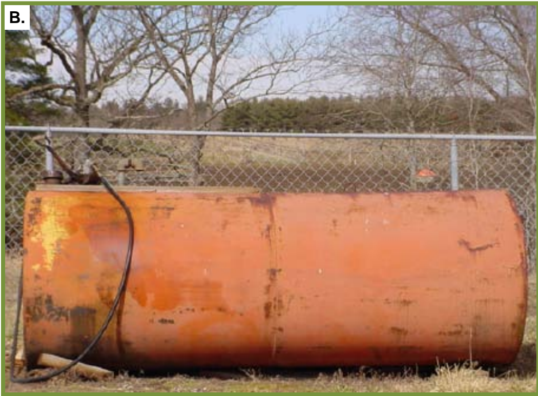
Figure 3. Outdoor oil storage tanks in locations that would obviously (rather than “reasonably”) be expected to direct spills to surface waters in harmful quantities. (A) Diesel tanks on a hill above a lake and (B) a farm diesel tank on a hill above a creek.