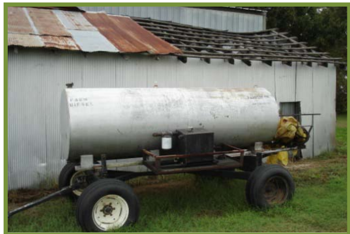
Figure 5. An on-farm diesel fuel nurse tank.

Farm nurse tanks ( Figure 5 ) do not require dedicated secondary containment but must be positioned to prevent a discharge (e.g., away from ditches).