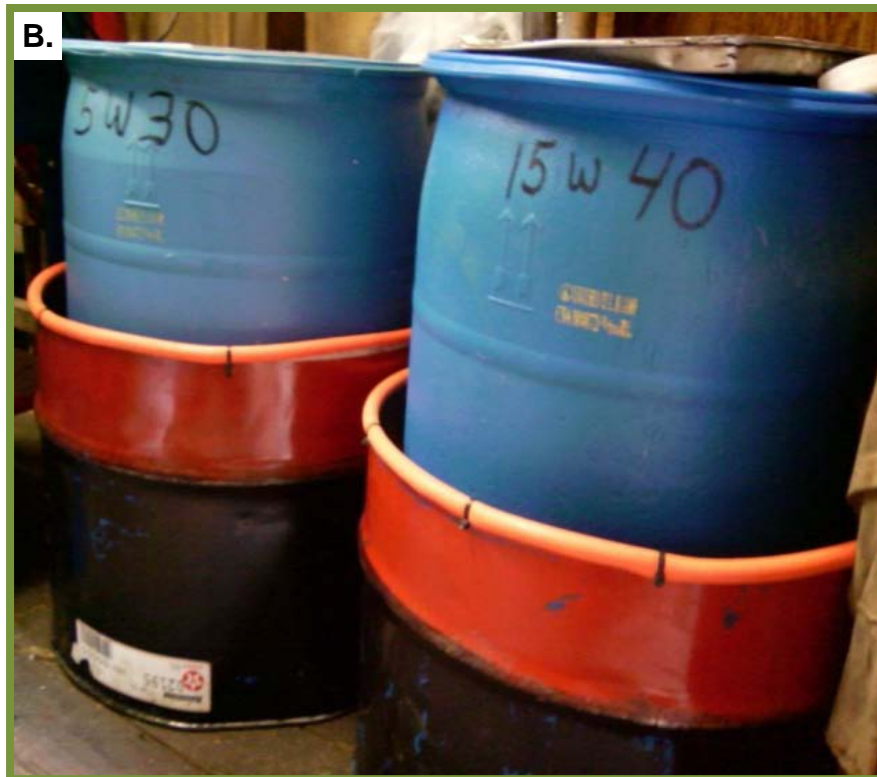
Figure 4. Examples of an outdoor (A) and indoor (B) oil storage tanks with oil spill secondary containment structures.