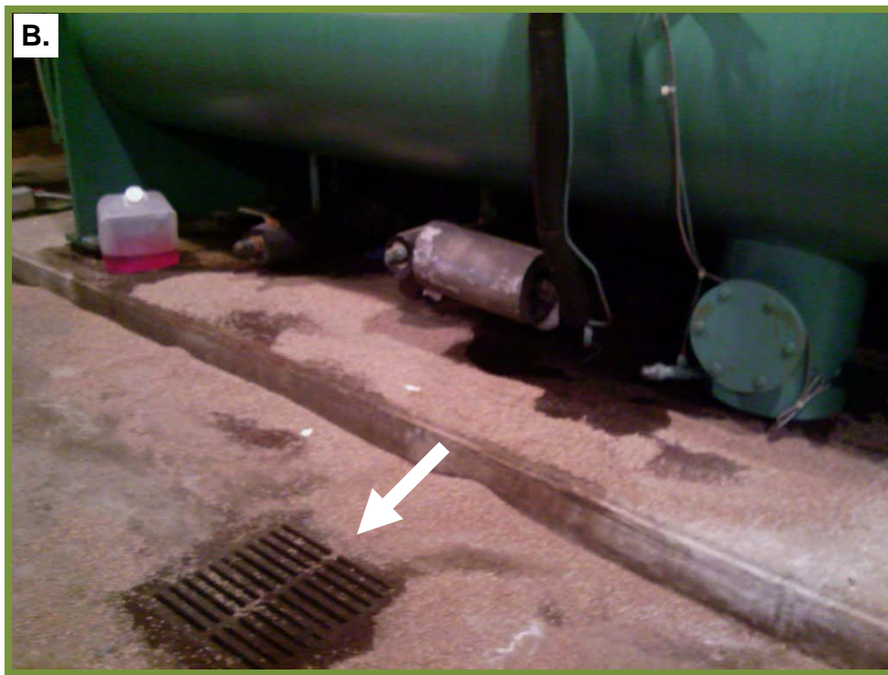
Figure 2. Outdoor (A) and indoor (B) oil storage tanks located near drains. The locations would obviously (rather than “reasonably”) be expected to direct spills to surface waters in harmful quantities.