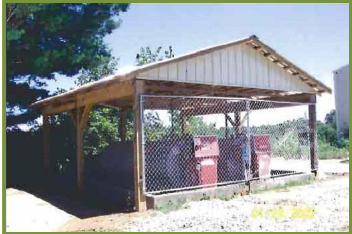
Figure 6. Gas and diesel tanks (1,000 gallons) with a roofed concrete secondary containment.

Where practical, place a roof over the tank and secondary containment so that rainfall does not accumulate within the structure ( Figure 6 ). Although a roof will represent an expense and something else to maintain on your farm, it will eliminate the hassle of managing accumulated water that could otherwise corrode the tank and tank supports. If your secondary containment is equipped with a drain, the