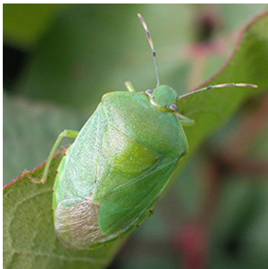
Green stink bug

The green stink bug ( Acrosternum hilare ) is the most common species that feeds on cotton in Tennessee. The brown stink bug ( Euschistus servus ) is another common component of the stink bug complex.