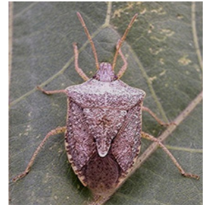
Brown stink bug

numerous uncultivated plants. Overwintering adults become active in the spring. Stink bug eggs are characteristically laid in a mass of 20-100. Eggs hatch in 6-7 days during the summer. Nymphs tend to remain aggregated until the third or fourth instar. All species pass through five immature (nymphal) life stages, which require 23-25 days at optimal tempera-