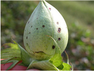
Boll injury from stink bug feeding

7-21 days in age. External signs of feeding injury include the appearance of circular black lesions on the surface of bolls (i.e., “catfacing”). These sunken lesions are typically about 1/16th of an inch in diameter. The lint of bolls may be stained, seed may be destroyed and feeding warts may be observed on the internal surface of the boll wall. Damaged bolls may rot due to secondary infection by plant pathogens, or lint production may be reduced in one or more locks. Other true bugs, such as the clouded plant bug and tarnished plant bug, may cause similar injury. External feeding signs on bolls are not always associated with internal damage.