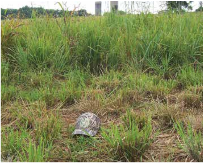
Fig. 8. A mixed stand of big bluestem and indiangrass harvested for hay on July 1, five days before photo was taken. Note clumps in the foreground that were cut to about 8 inches residual height. Regrowth has already begun because the growing points were not removed.

the early portion of the growing season is not strongly influenced by spring rains. During mid and late summer, though, rainfall exerts greater influence.