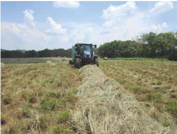
Fig. 9. This big bluestem/indiangrass blend hay was handled easily with traditional hay production equipment.

the larger stems. In many cases, disc mowers cannot be easily raised high enough for the desired 8-inch cutting height. A boot can be easily fabricated to solve that problem.