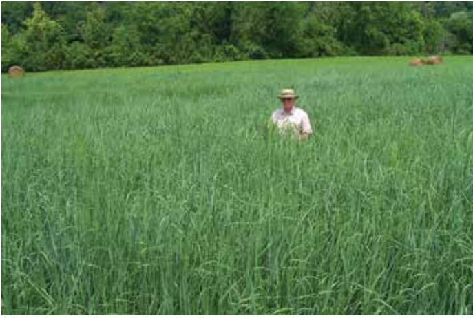
Fig. 7. This mature stand of Alamo switchgrass is ready to be harvested for hay. Photo was taken on June 10. Note that no seed heads have emerged yet, indicating the stand is still in boot stage.

bluestem (Table 2). Eastern gamagrass can be a bit more forgiving in this regard because of its growth habit – the leaves emerge directly from the base rather than from an elongated stem.