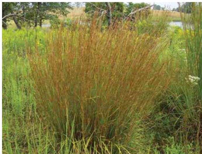
Fig. 4. Little bluestem, as its name implies, is shorter than the other NWSG, but still retains the “bunch” growth habit common to these species.

As with any forage grass, there is a trade-off between forage quantity and quality. For most forage grasses,