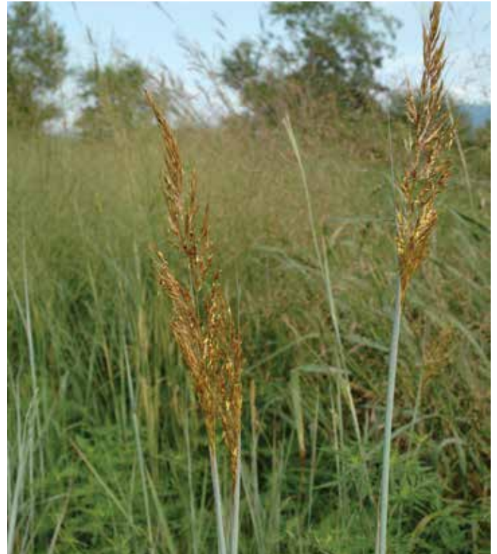
Fig. 5. Indiangrass can be recognized by its pale green stems and golden head. The seedhead appears in August, later than the other NWSG.

including NWSG, harvesting during the late-boot or early-seedhead emergence stages provides an optimum combination of quality and quantity (Fig. 7). Because NWSG can become quite stemmy as they begin seedhead development, it is important not to delay harvest beyond the late-boot stage. This is particularly true with switchgrass, but is also a concern with indiangrass and big