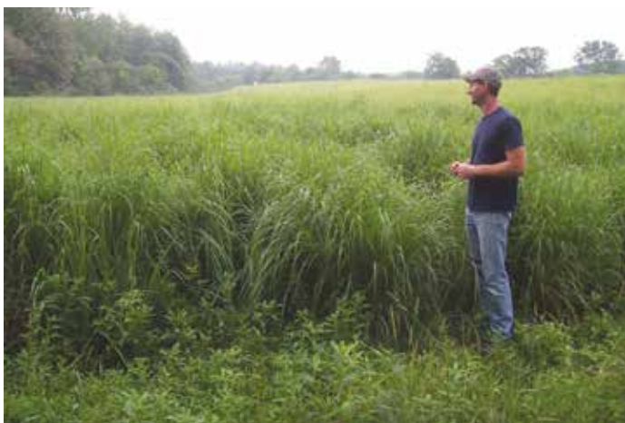
Fig. 11. A well-managed stand of big bluestem ready for harvest in central Kentucky. Photo taken on July 5. Native warm-season grasses can be quite productive in the Mid-South, providing high-quality forage during hot, dry summer months.

good guideline is to fertilize once the stand is about 12 inches tall and outgrowing weeds. Also, evidence shows such early applications are preferable to mid-season applications. Do not apply P and K unless they test in the low category. If they do test low, follow soil lab recommendations for supplementing P and K.