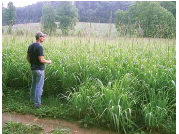
Fig. 6. Eastern gamagrass is a robust grass with an unusual seed head that is the earliest of the NWSG to come out, typically in late May.