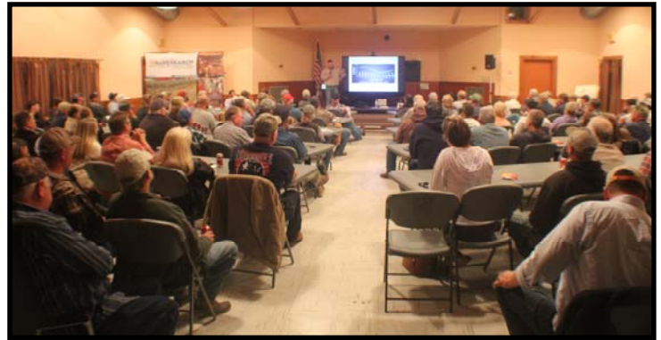
Graduates of the Williamson County/UT 2017 Advanced Master Beef Producer class — 121 participants.