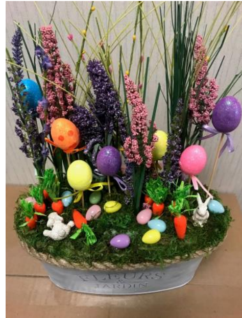
1 st place—Gracie Baldwin (5 th grade)