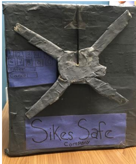
1 st place—Gracie Sikes (6 th grade)