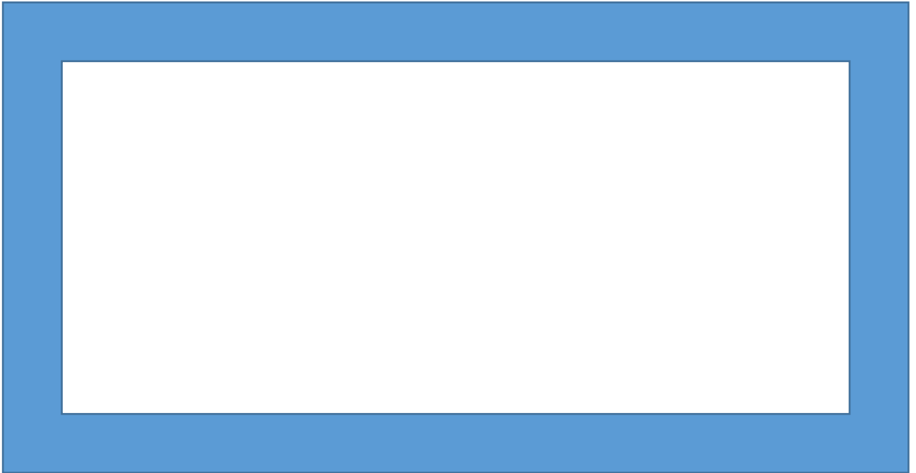
Beginning of Project

Taking a picture of your project animal(s) at the beginning and at the end of your project will indicate how your animal(s) have grown and developed.